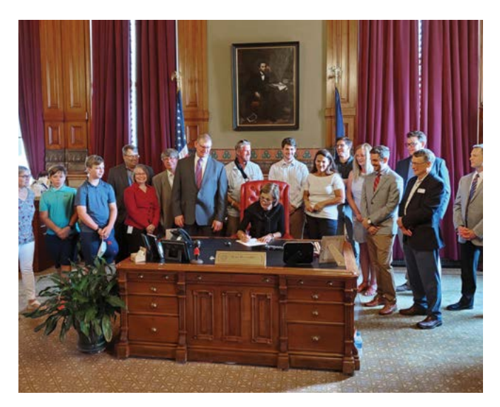
In a major legislative victory, House File 737 ushered in significant improvements to Iowa's companion animal abuse statute. The law went into effect July 1.