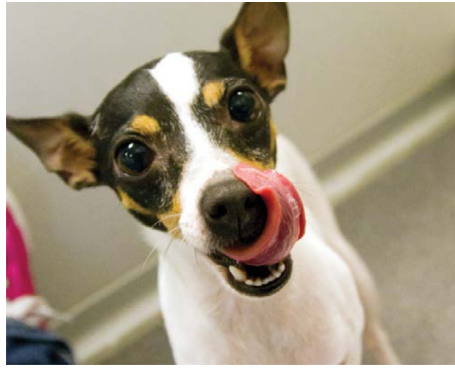
2020 brought an improved way to feed the pets in our care. Our Full Bellies Food Program ensures our pets receive a consistent, high-quality diet, significantly reducing digestive issues that can cause pets to stay in the shelter longer.