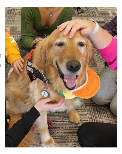
BENNET on one of his TheraPets visits in the community,

When the deposition came around, Bennet, as always, was there as a support for the child, and the child found strength and comfort in having a friend by their side.