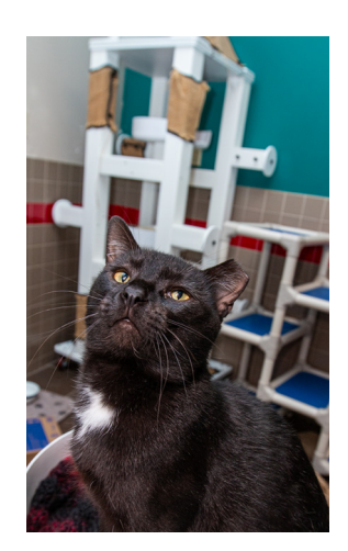
DOODAD looks out at adopters in the Cool Cats Condo at ARL Main.

and needs different things in order to succeed. For some cats, it's our Cool Cats Condo made possible by you!